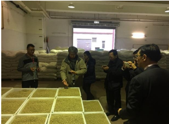
Visit to food waste recycler, animal feed products displayed

Members of Advisory Committee on Recycling Fund visited the EcoPark on 20 January 2016 to comprehend the local recycling industry as a circular economy to provide a sustainable solution to our waste problems. Three tenants were also visited to understand the recycling processes in waste wood, food waste and plastics.