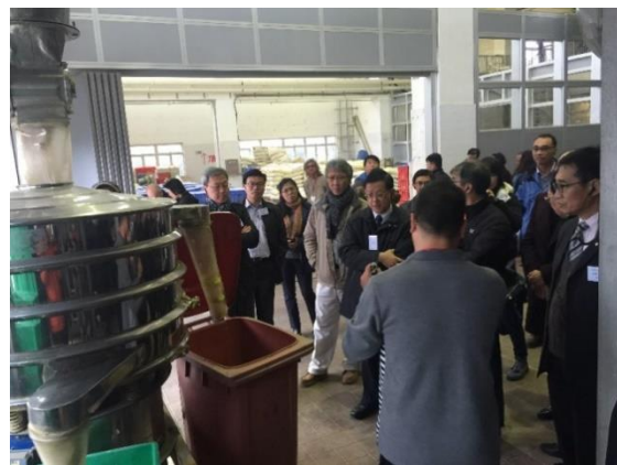
Members understanding operation of food waste recycling