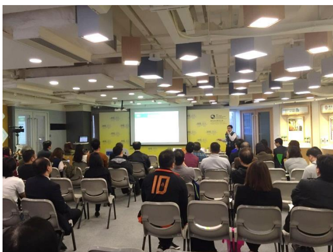
Photo of the participants

The briefing on the Recycling Fund was held at SME One, HKPC Building on 4 March 2016, introducing to the enterprises in the recycling industry and non-profit distributing organisations the funding scope and application details and reminder gained from the experience of processing the first batch applications. The briefing was conducted in Cantonese by the Fund Secretariat. Around 60 participants joined the briefing.