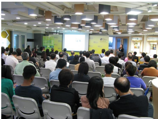
Photo of the participants

The briefing on the Recycling Fund was held at SME One, HKPC Building on 13 November 2015, introducing to the enterprises in the recycling industry and non-profit distributing organisations the funding scope and application details. The briefing was conducted in Cantonese by the Fund Secretariat. Around 90 participants joined the briefing.